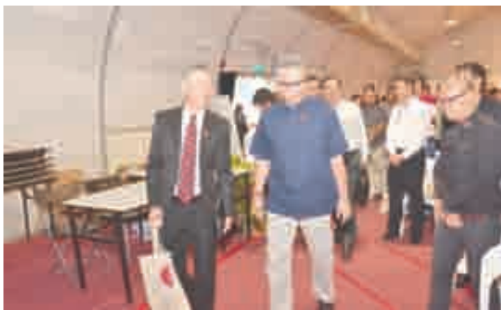
Touring the exhibit grounds