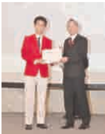
Awards presentation to recipients