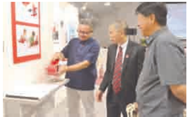
Closer inspection of an exhibit prototype