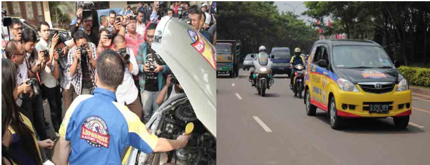
The car and motorcycle used in setting the World Record for Lupromax EA engine oil additive that resulted in receiving the Prestigious MURI Award for running for more than 8 hours without oil.