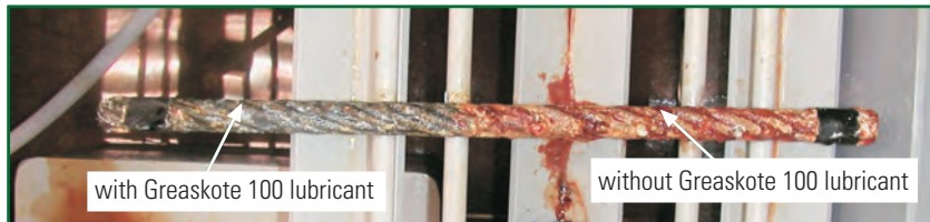
ASTM B117 SALT SPRAY TEST RESULTS (After 1000 hours)