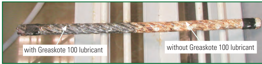
ASTM B117 SALT SPRAY TEST RESULTS (After 456 hours)